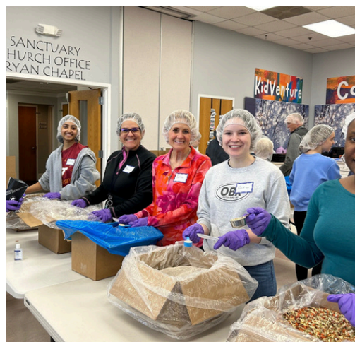
engagement through service

The volunteer platform, Volunteer Loudoun, is well underway. We have met with several community non-profits that are excited about listing their volunteer needs on this new site. Efforts to enroll users have begun and will be in full swing starting this month. Once live, this database will allow the community to find and connect with service opportunities across Loudoun County. Information on how you can connect to this new resource will be shared in Sunday worship and across all Crossroads communication channels.