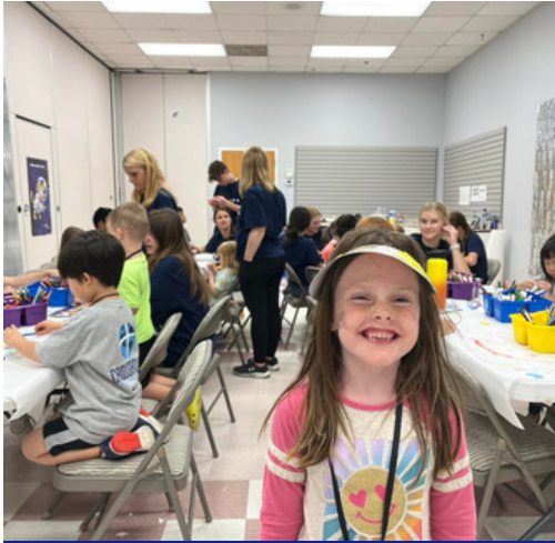
expanded options for children

The dreaming has begun about what can be done to offer more options for kids in our community. Staffing and facility changes to allow for expansion will begin in the 2025-26 school year. We plan to offer a program for 2 1/2 year olds and offer longer day class options for some age groups. Currently, our plan is to offer after school care for elementary aged kids in our community for the 2026-27 school year.